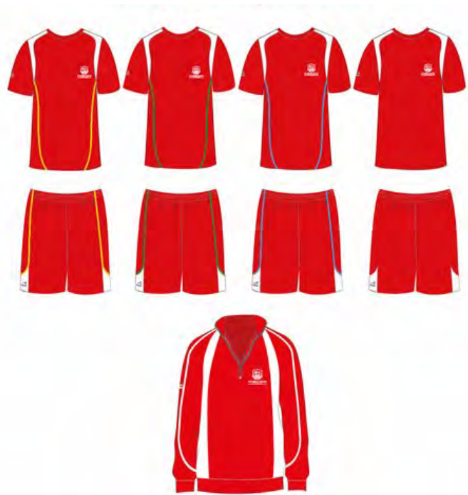
Sportswear - Girls and Boys