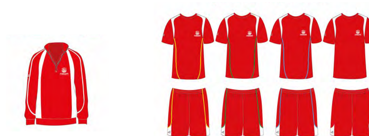
Sportswear - Girls and Boys