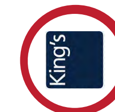
The KCH School Clinic Team doctor@englishcollege.ac.ae nurse@englishcollege.ac.ae