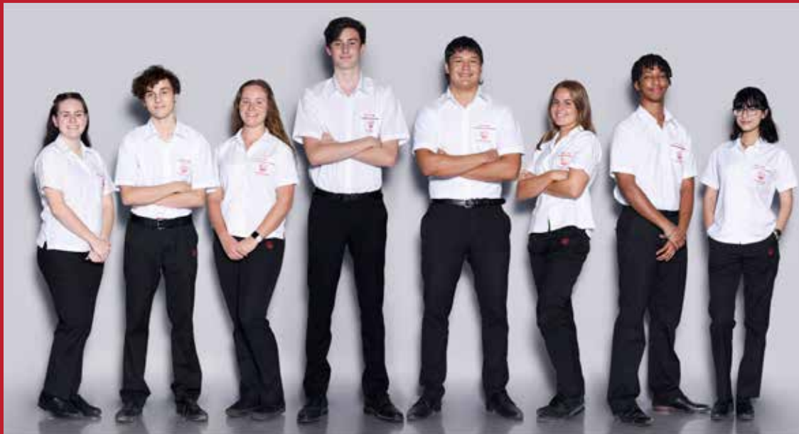
The English College Dubai 2020-2021 Student Cabinet

Places are offered on a first come, first served basis and subject to The English College being able to provide adequate provision for the student. Please complete our online application form: https://www.englishcollege.ac.ae/online-application/